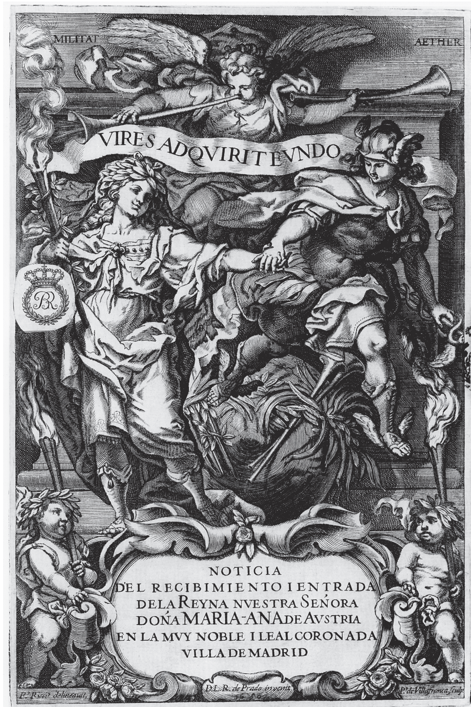
Fig. 5. Noticia del recibimiento i entrada de la Reyna nvestra Señora Doña Maria-Ana de Avstria en la muy noble i leal coronada Villa de Madrid , 1650, title page. Biblioteca Nacional at Madrid (R 4308).